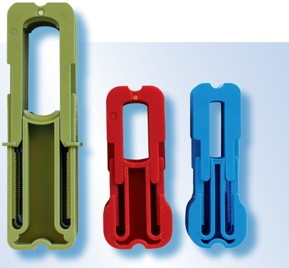
SafeSeal closures L (green), M (red), S (blue)

The SafeSeal opener in the sizes L, M, S. For the easy opening of the different SafeSeal closures.