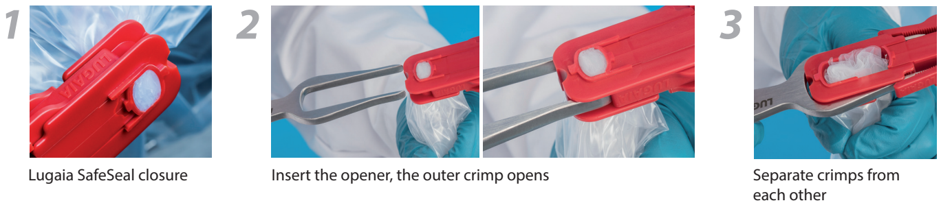
Lugaia SafeSeal closure