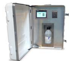
Mobile BioVap™ System is fitted inside a handy case